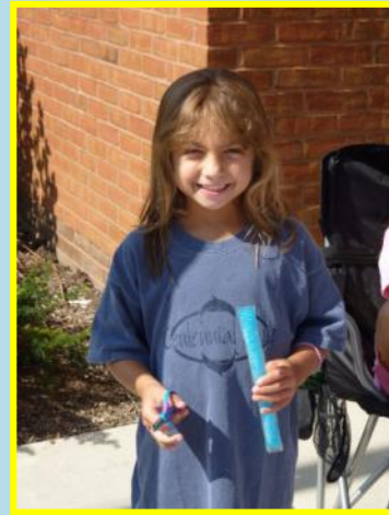
Enjoying popsicles on a hot day