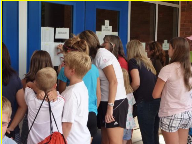
Parents & students eagerly search the class lists